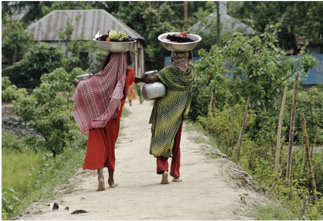
Photo 6: Women Returning Home from Market with Purchases in Bangladesh