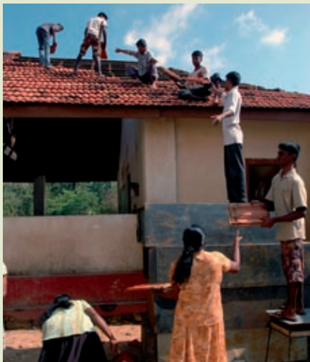
Work on a school in Sri Lanka.

Community-based infrastructure programmes are multisectoral, participatory, and respond to demands and needs identified at the local (village) level.