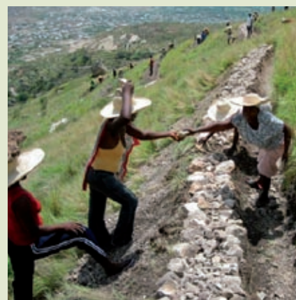
Environmental rehabilitation in Haiti.

Source: ILO, UNDP, WFP, and Republic of Haiti, 2009 6