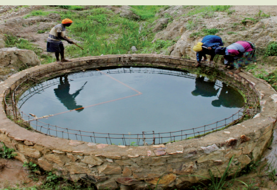
Reservoir used in Rwanda to irrigate crops.