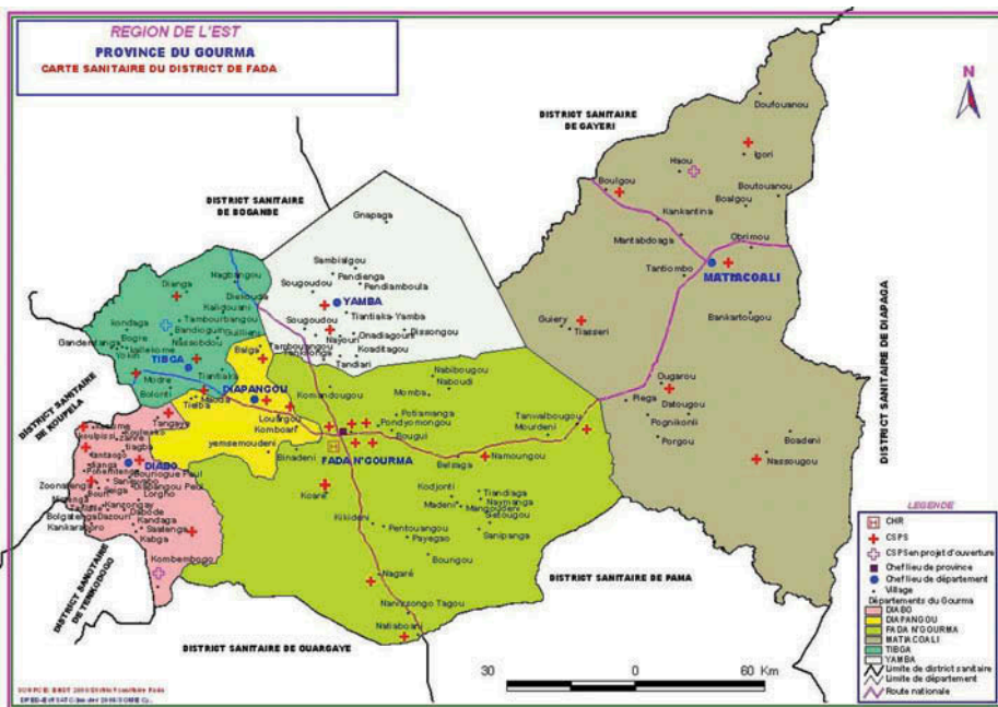
Figure 1. Map of study site in Gourma Province.

3.2.1. Sampling: impact evaluation. Villages were selected according to a three-step process. First, Gourma Province in eastern Burkina Faso (Figure 1) was selected because HKI had experience implementing nutrition and health programmes in this area. Within this region, four departments