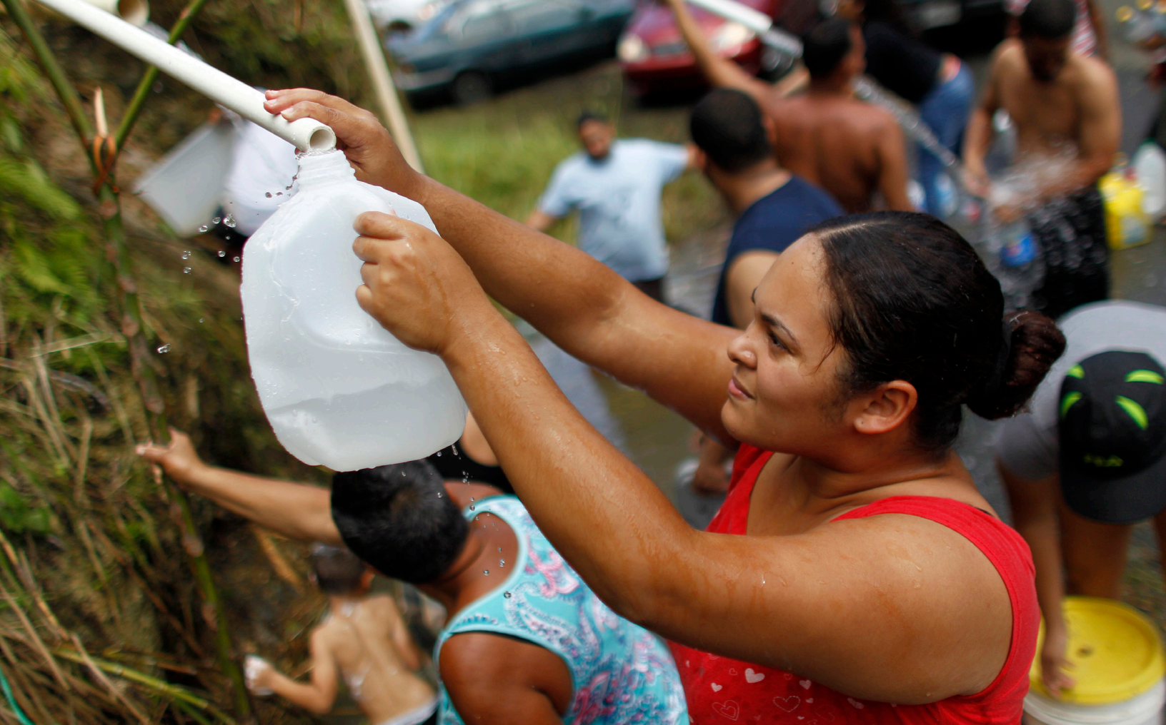
A woman collects water from a natural spring created by the landslides in a mountain next to a road in Corozal, west of San Juan, Puerto Rico, on September 24, 2017. Before the hurricane, most households in Puerto Rico enjoyed indoor plumbing and reliable running water. When the electricity and the water failed, the roughly 3.3 million people on the island faced an immediate crisis. Since water is absolutely vital to a household, the first and primary challenge was to make sure there was a consistent supply.