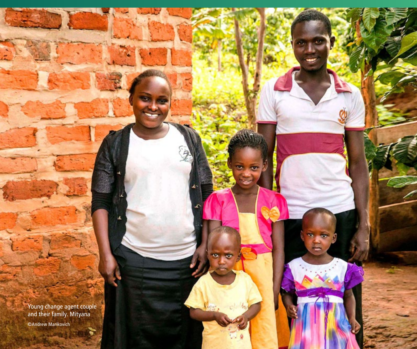
Young change agent couple and their family. Mityana