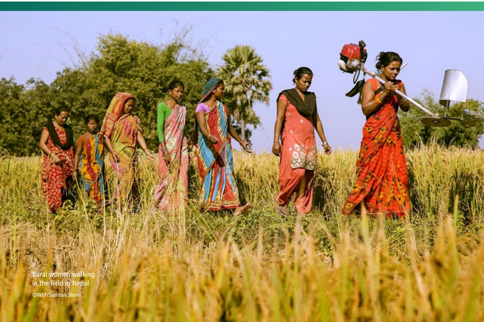
Rural women walking in the field in Nepal