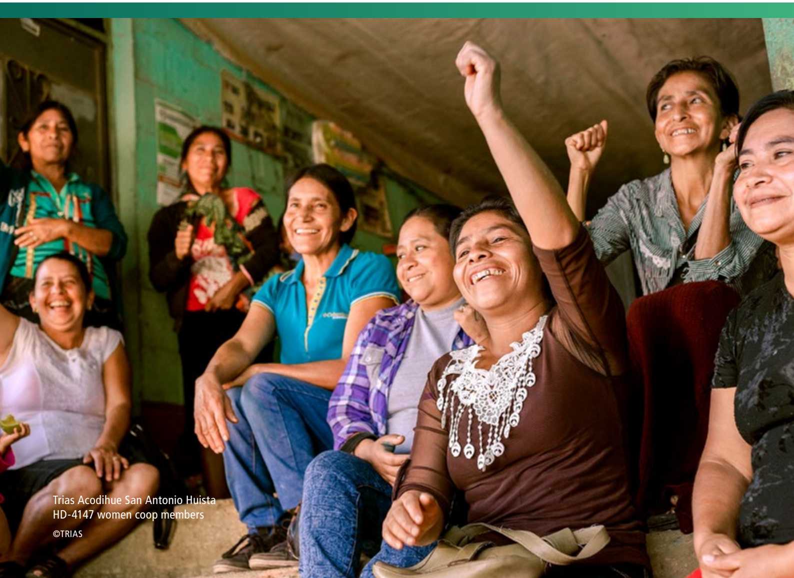
Trias Acodihue San Antonio Huista HD-4147 women coop members