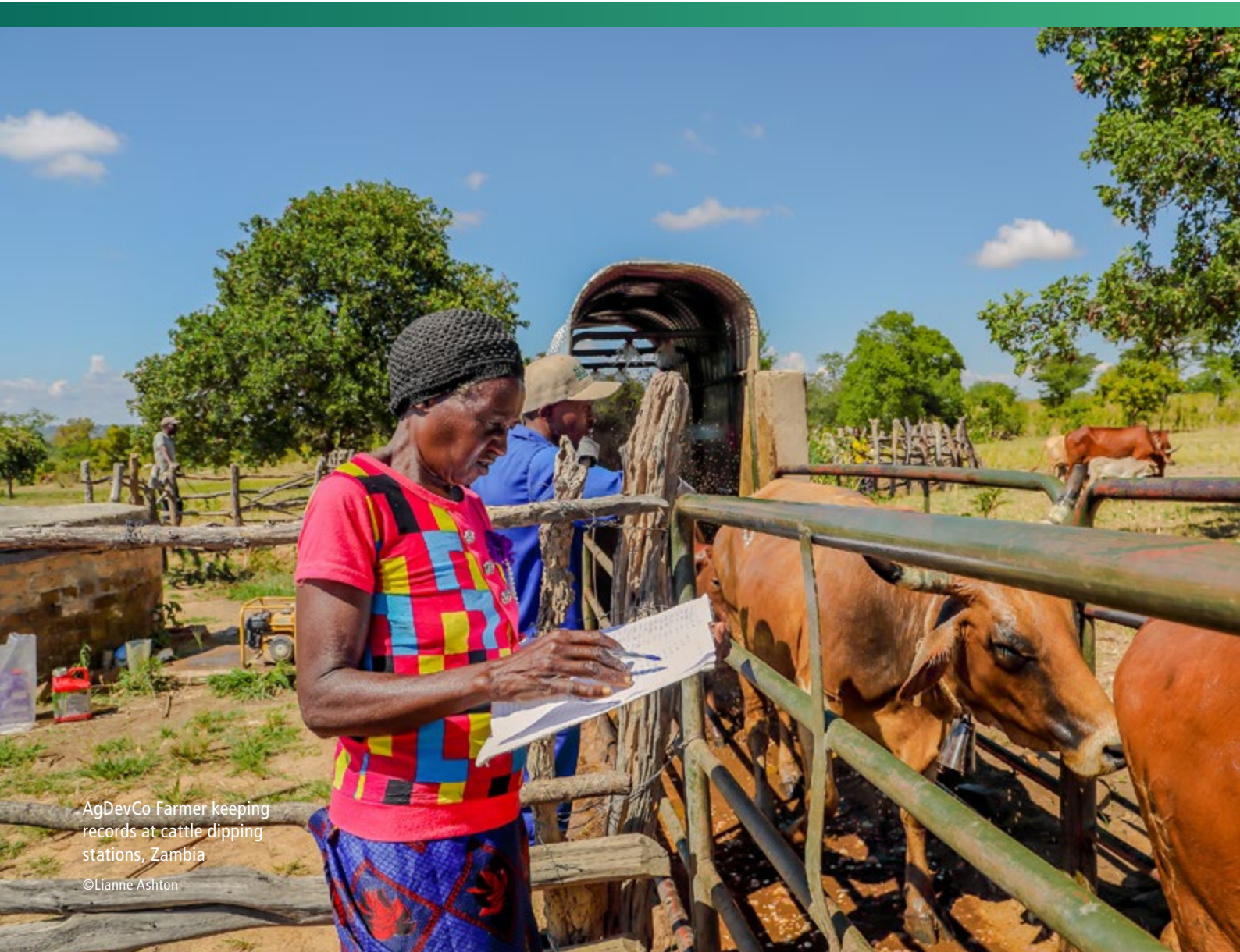
AgDevCo Farmer keeping records at cattle dipping stations, Zambia