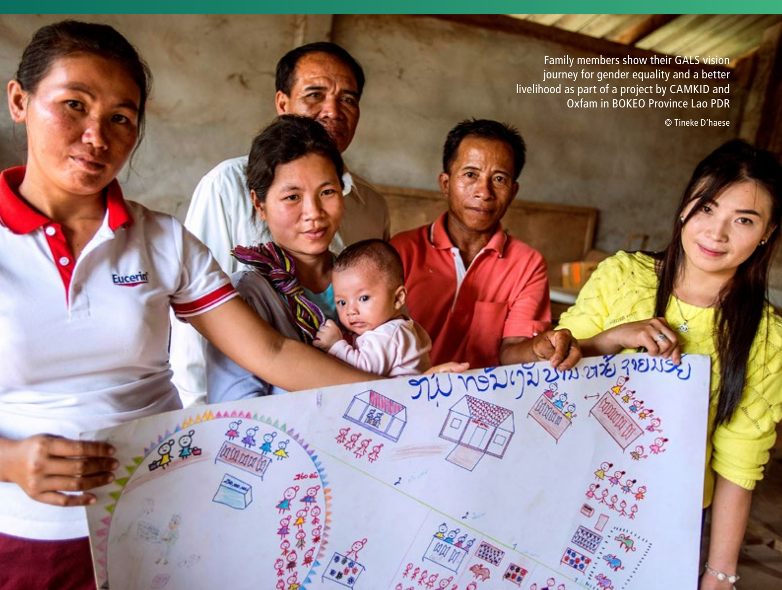
Family members show their GALS vision journey for gender equality and a better livelihood as part of a project by CAMKID and Oxfam in BOKEO Province Lao PDR