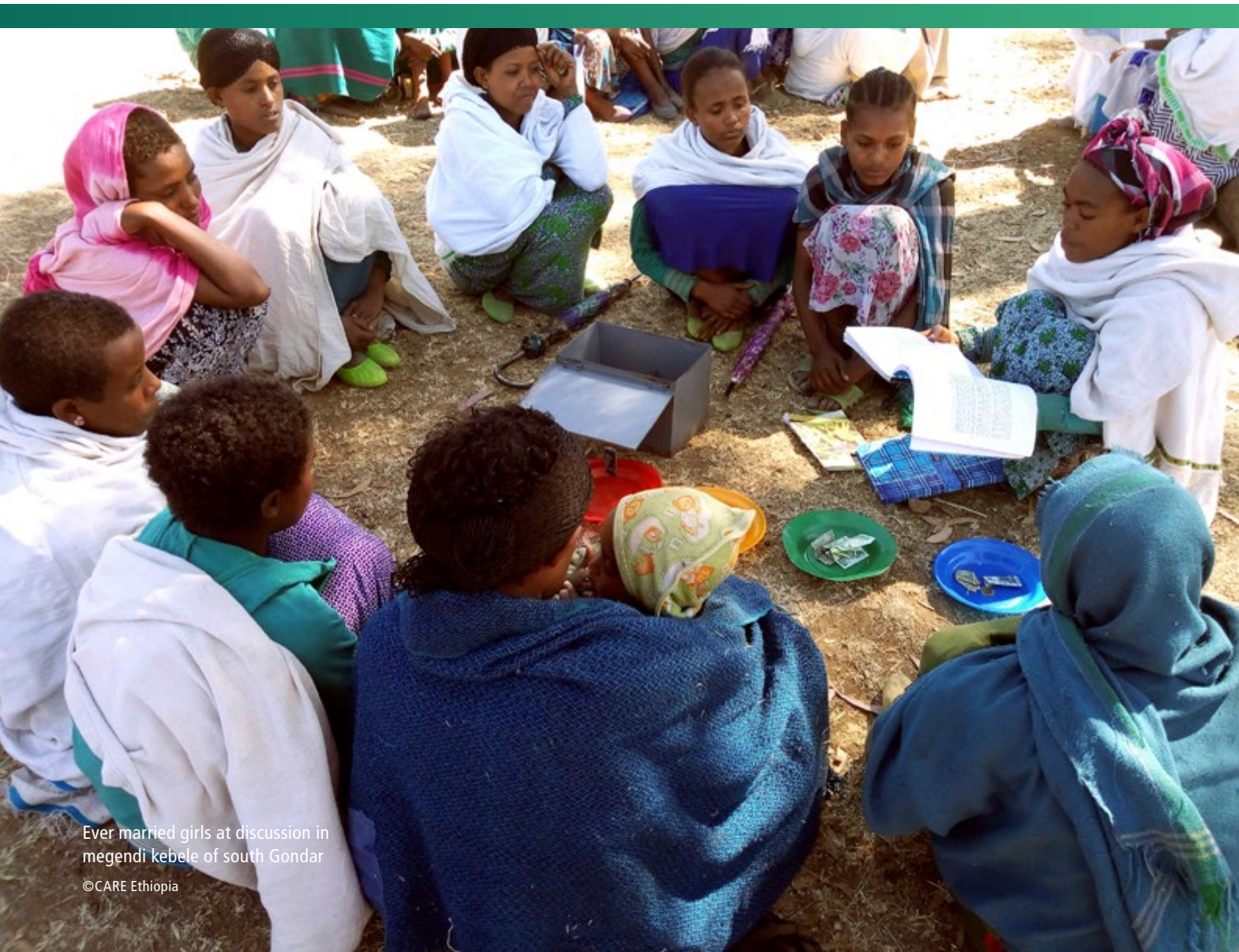
Ever married girls at discussion in megendi kebele of south Gondar