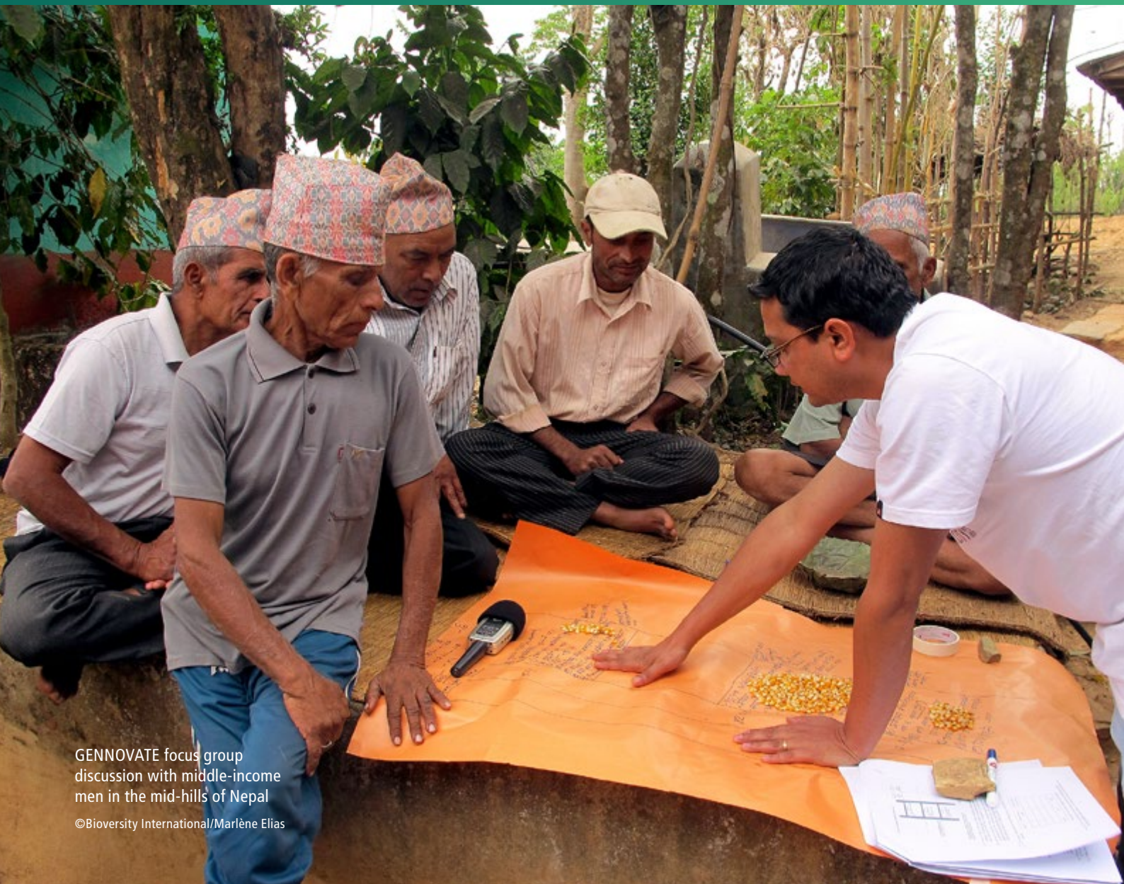
GENNOVATE focus group discussion with middle-income men in the mid-hills of Nepal