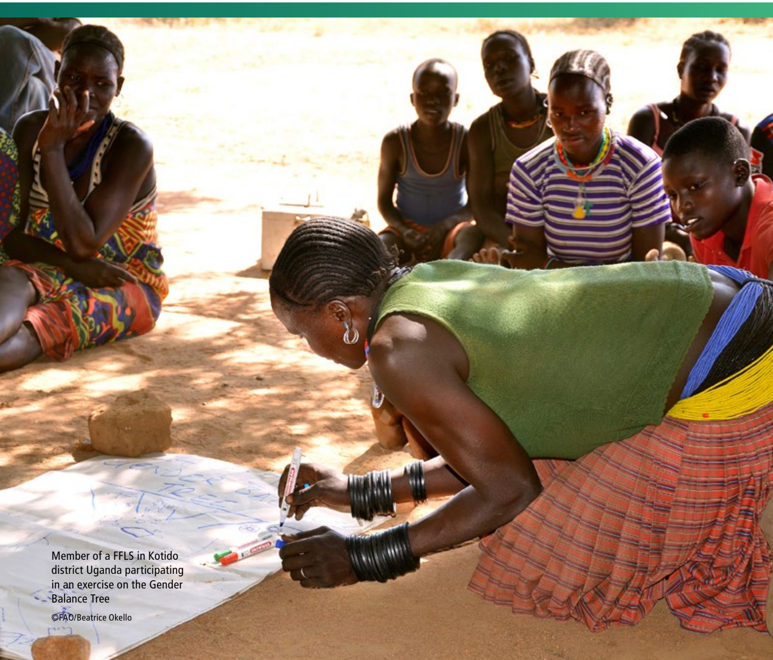
Member of a FFLS in Kotido district Uganda participating in an exercise on the Gender Balance Tree